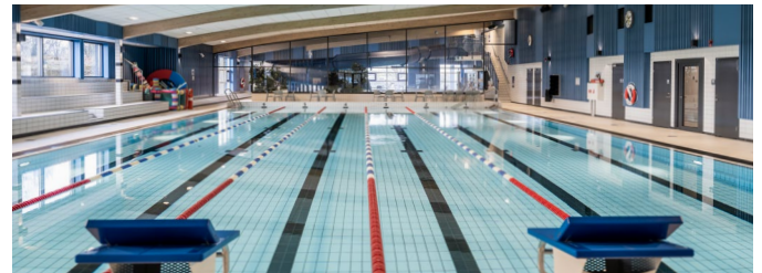
Reliable and corrosion-free valves are essential for providing a high water quality in swimming pools.

same time, the Electro-pneumatic Positioner has automated processes such as backwash and splash drains. As a result, the Kaskad swimming pool now benefits from a cost-effective and long-lasting system with modern functionality that improves the experience for staff and customers.